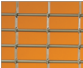
G-8 Pattern 4" (optional)