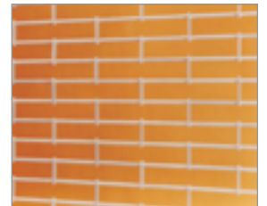
G-1 Pattern 4" (optional) G-1 Pattern modified 3.125"

For technical information, specifications, drawings, visit wayne-dalton.com . Not all patterns available in all sizes. Consult factory for more information.