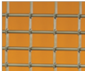
G-3 Pattern 3" (optional)