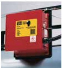
Waynegard™ Release Systems