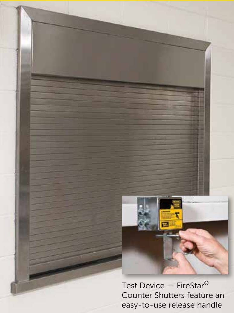
Test Device – FireStar® Counter Shutters feature an easy-to-use release handle