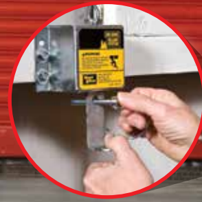
Test Device — FireStar® doors feature an easy-to-use release handle.