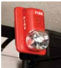
Horns and strobes