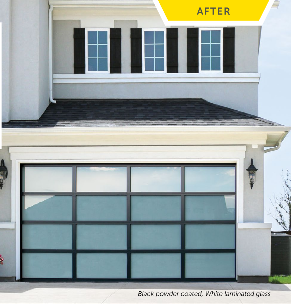
Black powder coated, White laminated glass