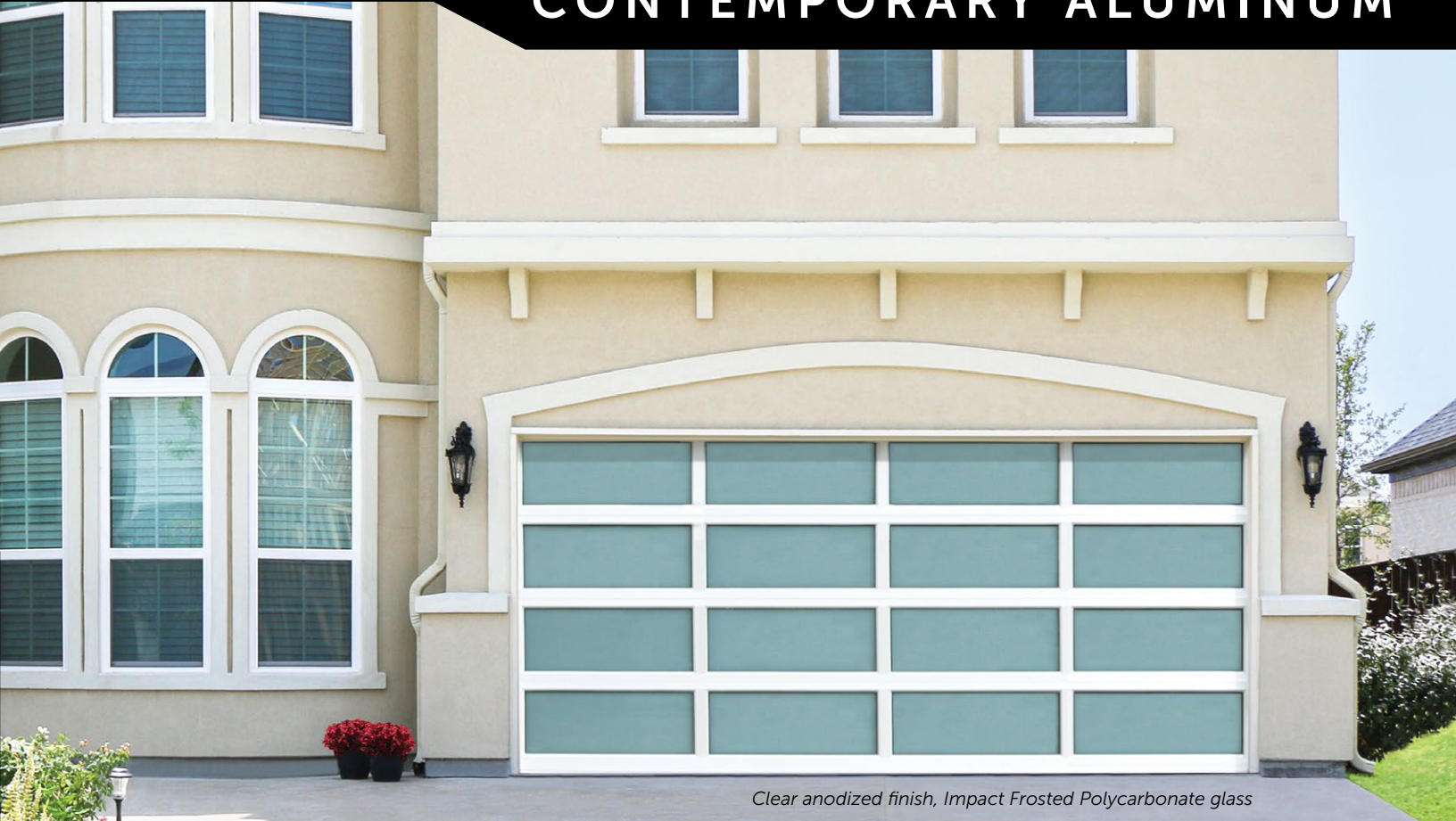
Clear anodized finish, Impact Frosted Polycarbonate glass