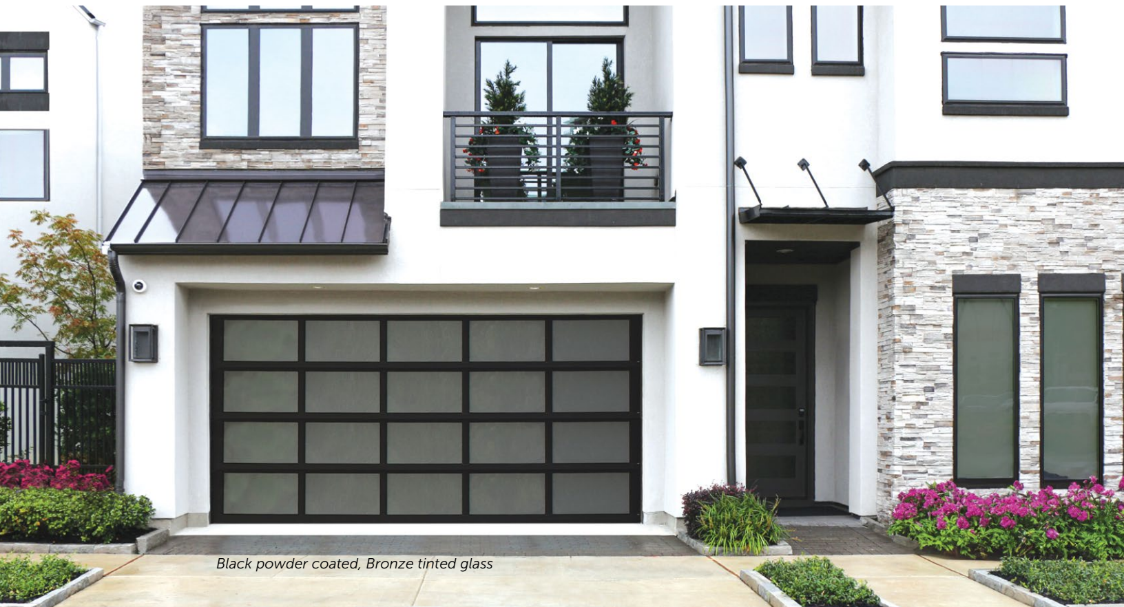
Black powder coated, Bronze tinted glass

Actual colors may vary from brochure due to fluctuations in the printing process. Always request a color sample from your Wayne Dalton dealer for accurate color matching.