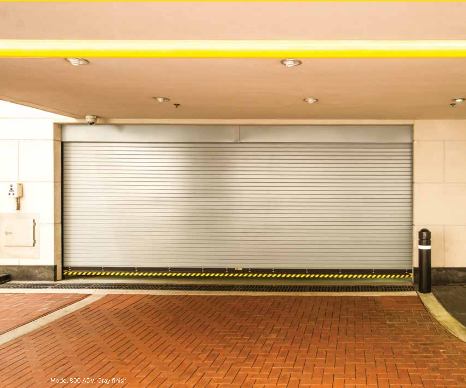
Model 800 ADV, Gray finish