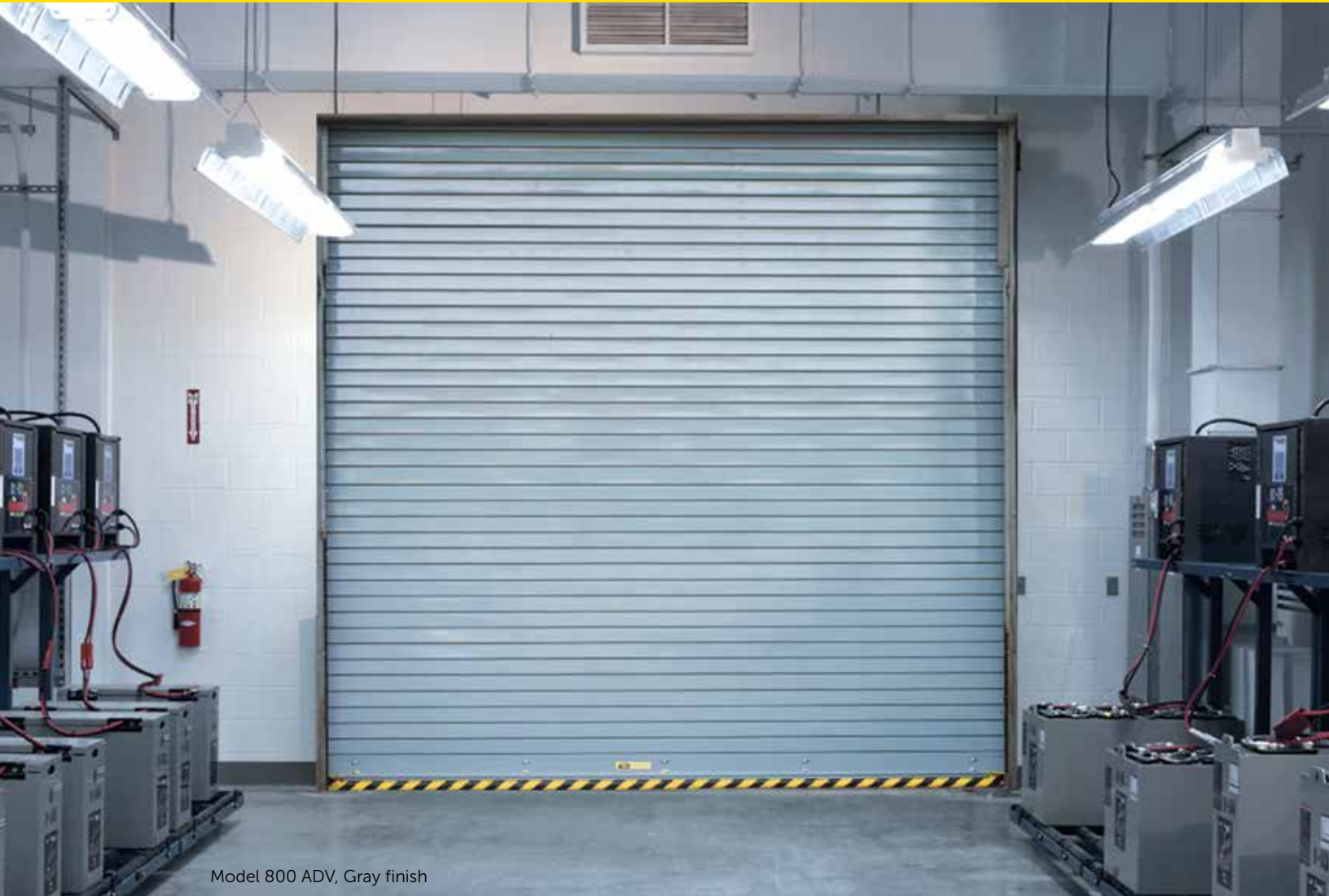
Model 800 ADV, Gray finish