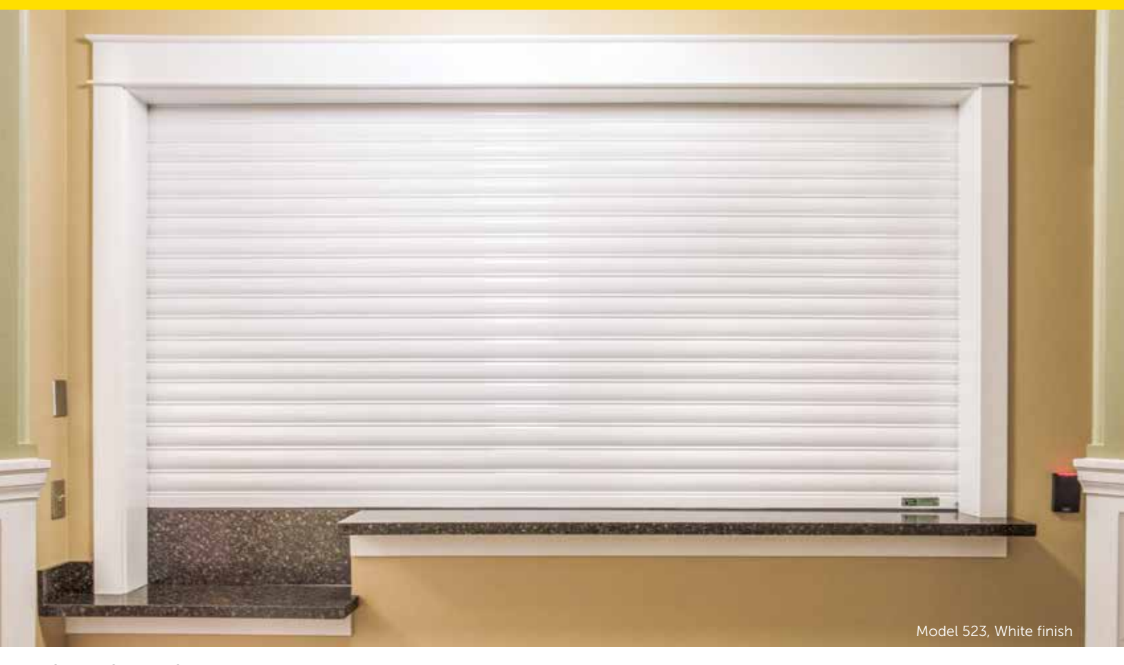
SLAT STYLES Standard slat